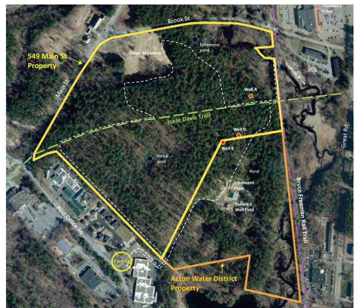
549 Main Street sits at the prominent intersection of Brook and Main Streets.

The 549 Main Street parcel is crucial for watershed protection as it directly abuts the 24-acre parcel at 8 Post Office Square Behind, the site of the District's Conant II groundwater wells. The District owns an additional 31 acres of land to the north along the eastern side of Main Street, including the site of the Conant I well. Currently, just over 25% of the 549 Main Street parcel is classified as either Zone I or Zone II water supply protection area for the existing Conant I and II wells; upon approval of wells D and E, nearly 99% of the parcel will become Zone I area, demonstrating the critical nature of protecting this land.